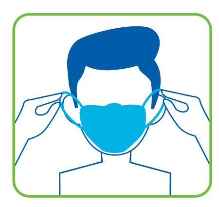
Handle by ear-loops, as front of mask is dirty. Remove from face, in a downward direction, using ear-loops