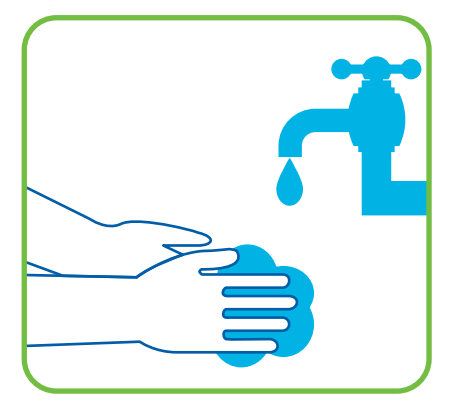
Wash your hands