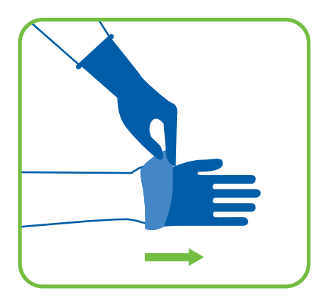
Peel the glove away from your hand, thus allowing the glove to turn inside-out