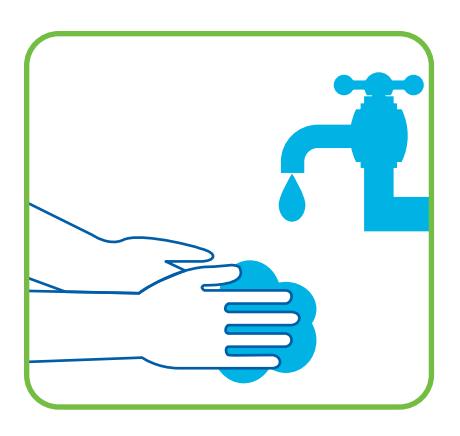
Wash your hands

Your well-being is important to us. Stop the spread!