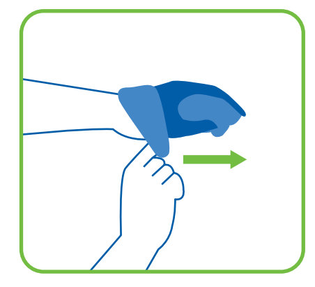
Peel the glove away from your body, turn it inside-out, leave the first glove inside the second