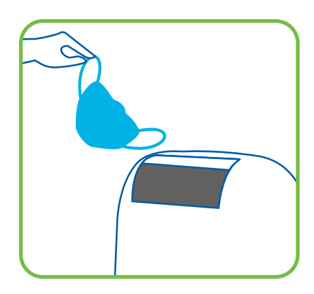
Discard mask in the disposal bin provided